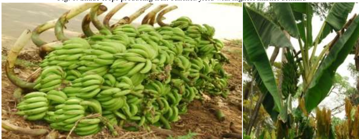
Figure 2: Picture showing type of banana bunches from the banana planted as shade crop within cocoa plot