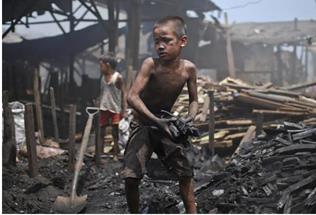
Figure 4. Filipino child laborers work in a charcoal dump, Manila, Philippines, 9 July 2012