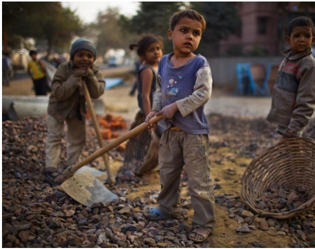
Figure 2. Indian children shoveling mine ore